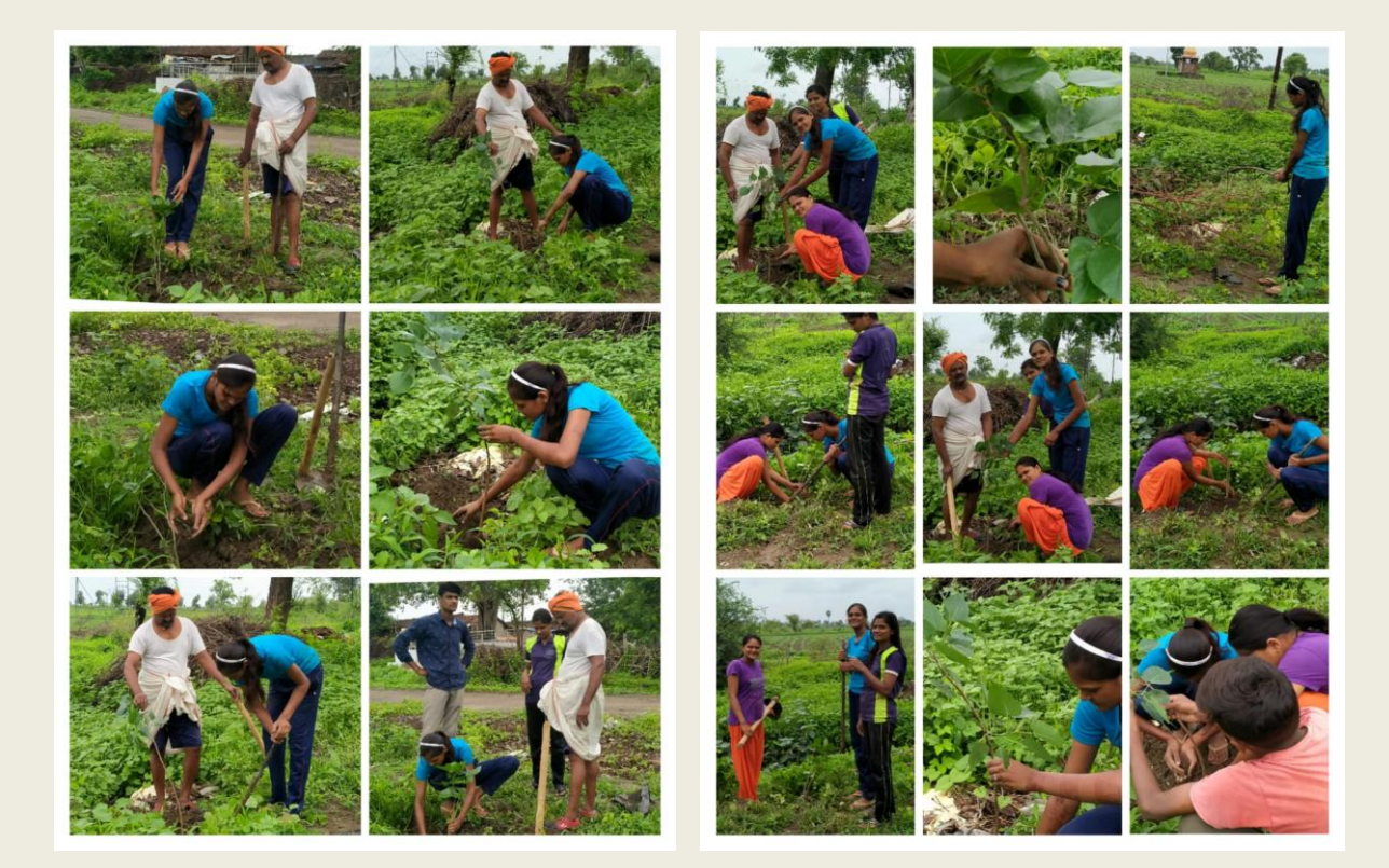
August, 2020 --- Tree Plantation Drive was conducted by the cadets in their native villages as colleges were closed due to Covid.