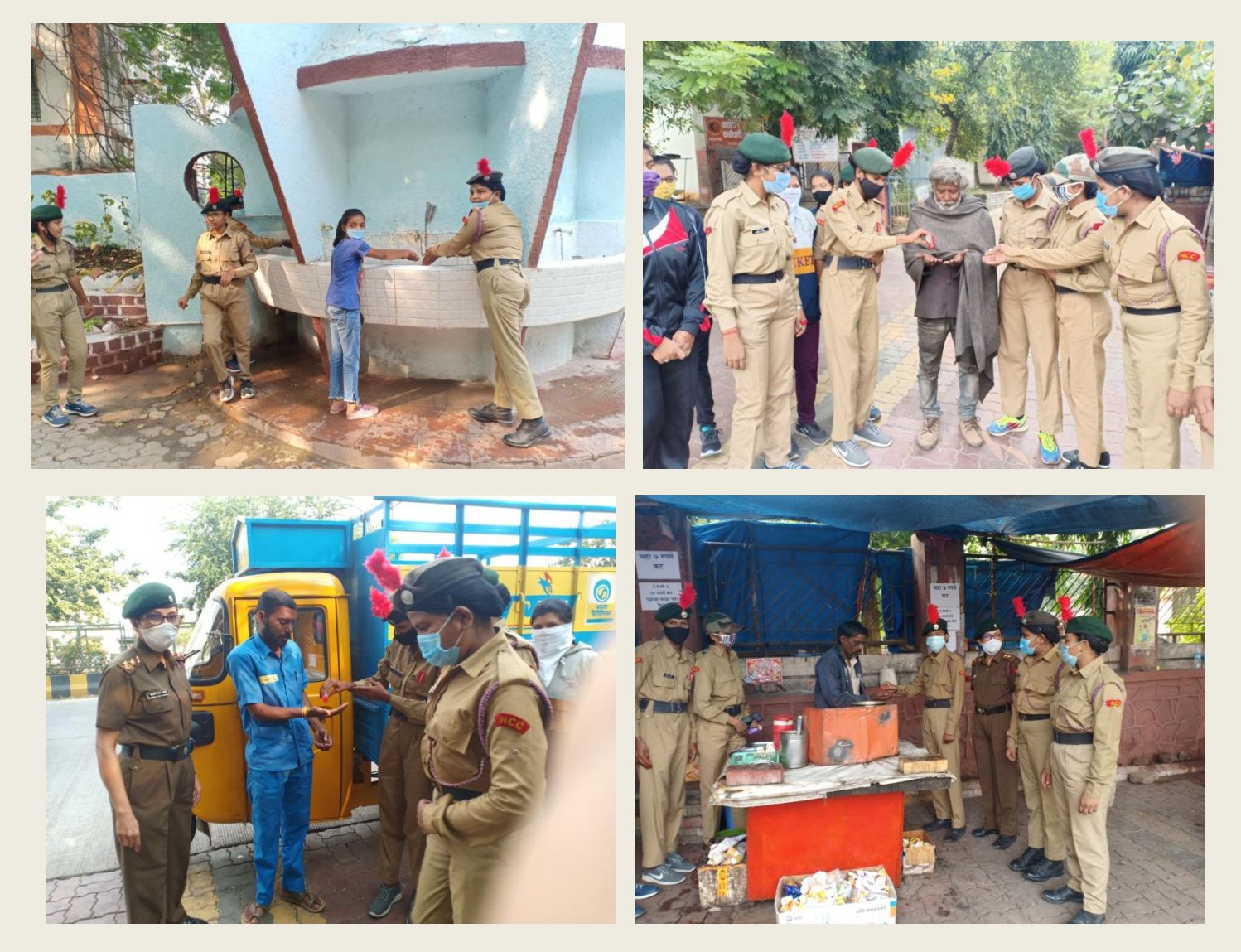
Hand wash Day—Importance and awareness of Sanitizing and washing hands was spread by cadets in Amravati as well as their native villages