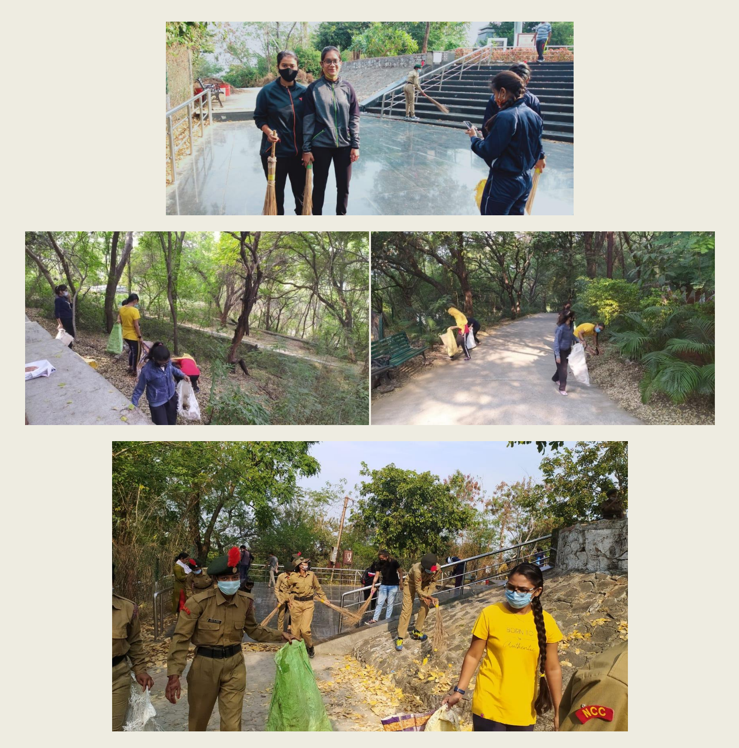
Swachhta Pakhwada December, 2020 — 1 to 15 December

Cleanliness Drive was conducted by our cadets on Shivtekdi Amravati. They cleaned the surrounding area and also the statue of Chatrapati Shivaji Maharaj.