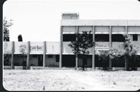
भूगोल व गृहअर्थशास्त्र विभाग